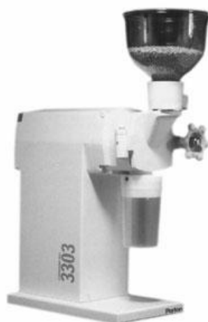
Fig. 2. Perten 3303 laboratory mill

For the valuation of cutting and performance, we used a Perten 3303 laboratory mill (Figure 2.). We poured the sample into the mill's pharynx, than we started the discs and by pulling the bolt, we started the mincing. The measurement lasted for a minute, under which we recorded it's cycle time, the mincing mass stream and the electric energy. We measured the power consumption (W) and the energy use (Ws), needed for the mincing on a monophase Power Monitor PRO power meter instrument, and the mincing time with a stopwatch. We measured the weight of the grist, produced in the mincing, with an electric scale, and we carried out the sieve analysis. For the grist's sieve analysis we used a laboratory sieve row and a shaking machine. With the help of the specific milling labour ( e_d - \text{kWh/t} ) and the formed grists specific increase in surface area ( \Delta a_d - \text{cm}^2/\text{g} ), specific grinding energy demand ( e_f - \text{kWh/cm}^2 ) can be calculated.