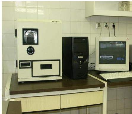
Fig. 1. Perten Single Kernel Characterization System (SKCS) 4100 device

During the measurement, the instrument (Figure 1.) measures the weight, size, moisture content and the hardness of the kernels. After determining 300 kernels unique properties it counts the average of the data gathered and counts standard deviation value and also, there is an opportunity to illustrate the measured results in column charts. The program provides an opportunity to see the last results after the following measurement. The measured results and their histograms can be printed if wished. The Hardness Index, produced by the machine as final results, is a physically non determined ratio, so in extremes cases the outcome can be zero or negative value.