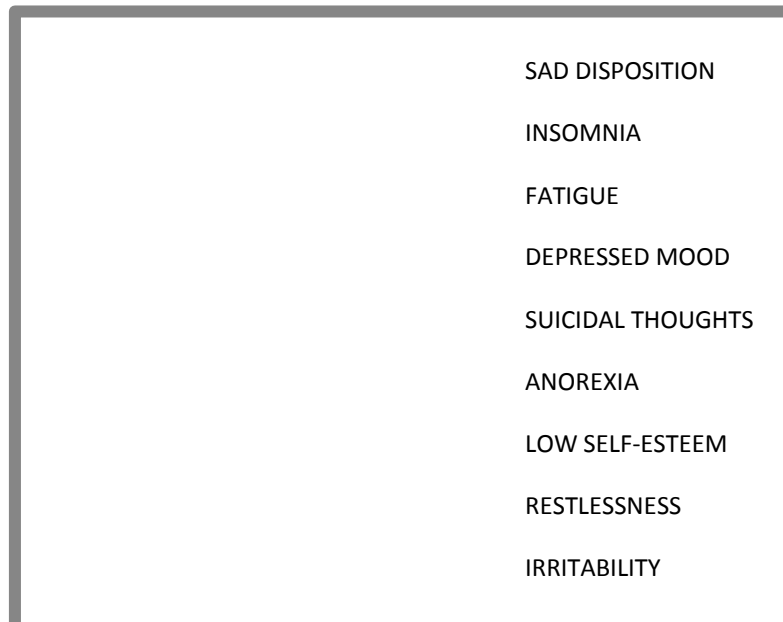
Fig.1. Reasons for admittance

As it is shown in table 3, long benzodiazepine was the most prescribed drug for all four months. Autumn was the only month where patients took a short acting benzodiazepine. Spring was the month that saw the most number of SSRIs being taken at home. Hypnotics were prescribed the most in the season of autumn as well. Overall the patients seen in summer were taking the least amount of medication before admittance.