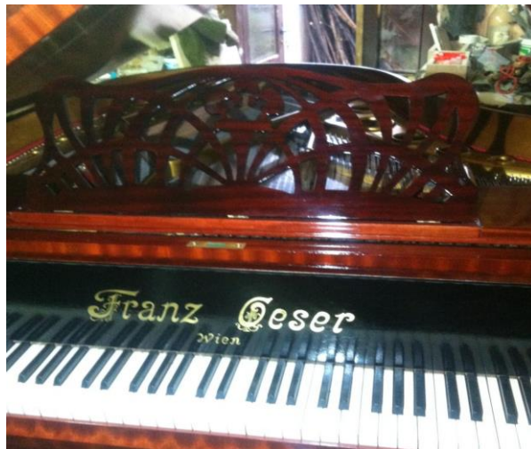
Fig.3. Polishing of elements

The next step was to clean and repair the keyboard, checking the flaps, hammers and other components. The hammers being numbered and cleaned of dust, the felt was cleaned from them and the felt was completely replaced from the keyboard housing (fig.2 and fig.3). For the damaged flaps, the ivory elements were replaced with others of the same age from another defective piano, these being adapted to the necessary shape and size, they being cleaned, rounded and bleached like the others.