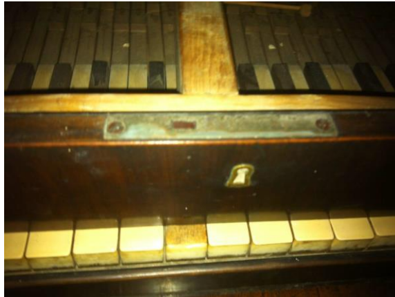
Fig. 1. Keyboard

The restoration of the piano begins with the dismantling of the moving and connecting elements, ie the metal parts such as: hinges, wheels, shield, locks, etc., or used solutions for cleaning and degreasing metal elements.