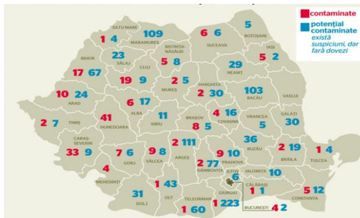
Fig. 1. The map of the contaminated and potentially contaminated sites of Romania. (image taken from the website of the National Agency for Environmental Protection.)

The first inventory of contaminated or potentially contaminated sites was made in the years 2007-2008. These have been identified by the National Agency for Environmental Protection, through the subordinated units, based on the analysis of the documentation that formed the basis for issuing the regulatory documents. A number of 1,682 contaminated/potentially contaminated sites have been identified, representing areas in which mining, metallurgical, petroleum, chemical and other industrial activities were mainly performed at a large or small scale.