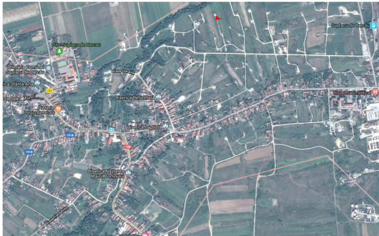
Fig. 2 The locality of Suplacu de Barcău and the identification of the location.(location established following the STEREO 70 coordinates)

The north-east of Bihor county has been an area dedicated to oil extraction since the 1970s. Before 1989, the Romanian industry was the property of the Government and after 1990 the privatisation process began. In the case of some privatisations, contracts were concluded in order to transfer the environmental obligations to the new owner/operative. The owner of the site contaminated with petroleum products, analysed here, is OMV PETROM, which in 2016 has conducted investigations on the location by collecting samples. The collected samples were analysed in order to determine the total petroleum hydrocarbons (TPH) concentration. The purpose of the investigations was the establishment of the degree of soil contamination on the well location (site) and the proposal of the remediation method for the land in question. The well site is located within the build-up area of the locality of Suplacu de Barcău, at an approximate distance of 500 m from the residential area. The well was drilled in 1977 and its activity was concluded in 1988, due to a lack of inflow and being defective, it was closed.