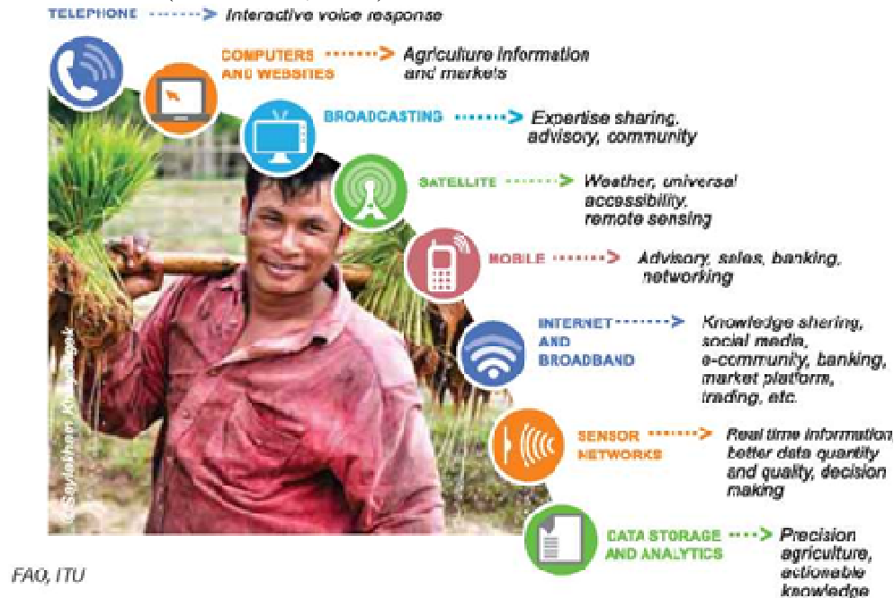
Fig. 2. Enabled ICT environment in agriculture

employees' productivity, new business models and increasing the benefits for end users (Nedeltchev, 2015).