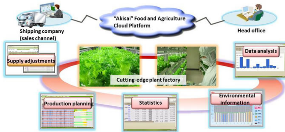
Fig. 3. Akisai Plant Factory

In this battle came not only traditional producers for agriculture but also those from ICT. In 2015, Fujitsu and Microsoft announced an offer for a solution that blends Fujitsu's Eco-Management Dashboard, an IoT service for the agricultural sector, and Microsoft's Azure database services (Microsoft News Center, 2015). This solution is based on the innovative work Fujitsu performed in Aizu-Wakamatsu, Japan. Fujitsu converted its semiconductor manufacturing operations into its Akisai Plant Factory, figure 3 (Fujitsu, 2013) – the largest low-potassium vegetables "Plant Factory".