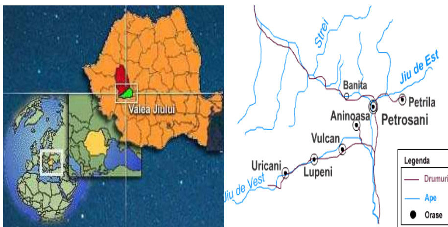
Fig. 1. Layout and composition Jiu Valley

In the south of Hunedoara county, in a triangle proved to be golden, on the border between Transylvania, Banat and the Romanian Country, lies an area known generically under the name "Jiu Valley" and geographically that "Petrosani Depression" region that has earned the reputation as the "Land of black Diamond" (fig. 1).