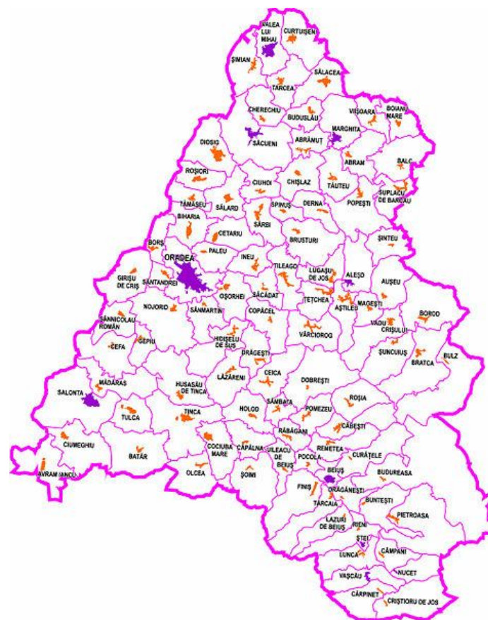
Fig. 1 Town and villages of depression Vad-Borod from Bihor county