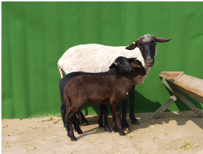
Picture 1.: Prolific Merino ewe with her Barbados Blackbelly crossbred lambs